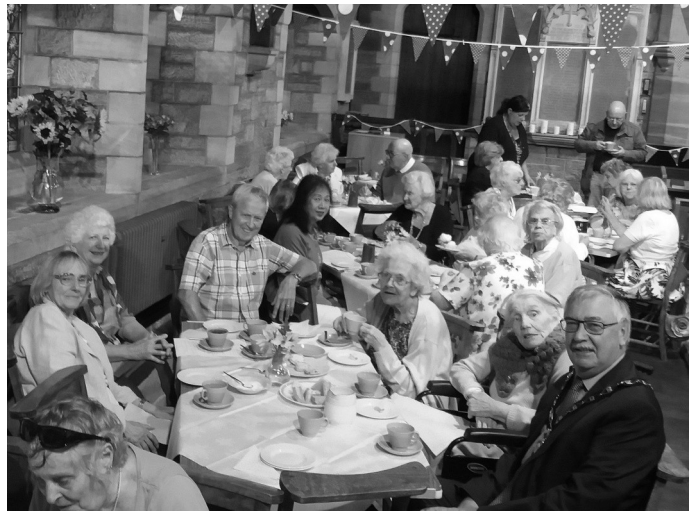
Pictured above: Church members enjoy afternoon tea in All Saints Deganwy.

Thanks to Cantamus Chamber Choir and Recorder Consort for their wonderful music in our Summer Concert. The strawberries and