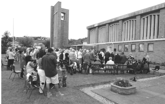
ABOVE: The congregation gathered at the open air service at St. David's BELOW: The Beulah Brass Band provided the music

The annual outdoor service supported by the Beulah Brass Band took place on 27th August, with a large congregation from St David's, St Katherine's, St Cystennin's, and Penrhyn Bay Presbyterian Church. There was a real time of fellowship afterwards with a BBQ - thank you everyone who helped make this a special event.