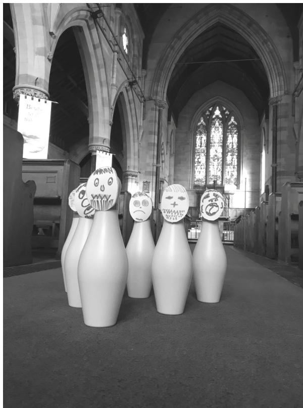
ABOVE: Skittles wearing Goliath masks lined up at St Paul's during preparation for the first family service in September. Much amusement was had drawing the faces! BELOW: more work for contractors. This broken stained glass is in the original 1890s West porch at the church, and was due to be repaired during October.