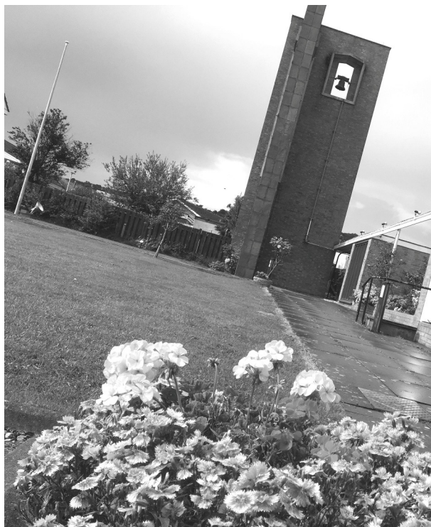
ABOVE: staying fresh into the autumn - the outdoor garden displays in front of St David's church. Note the belltower in the background.

There will be also be a Guide Dogs Fayre at Noddfa Retreat Centre in Penmaenmawr on Saturday 14th October, 1.30-3.30 pm.